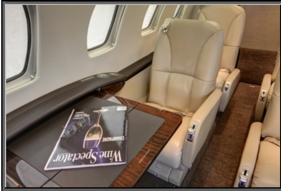
Work Table & VIP Seat