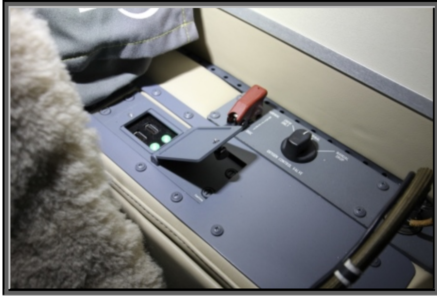
Collins DBU-5000 Data Loader