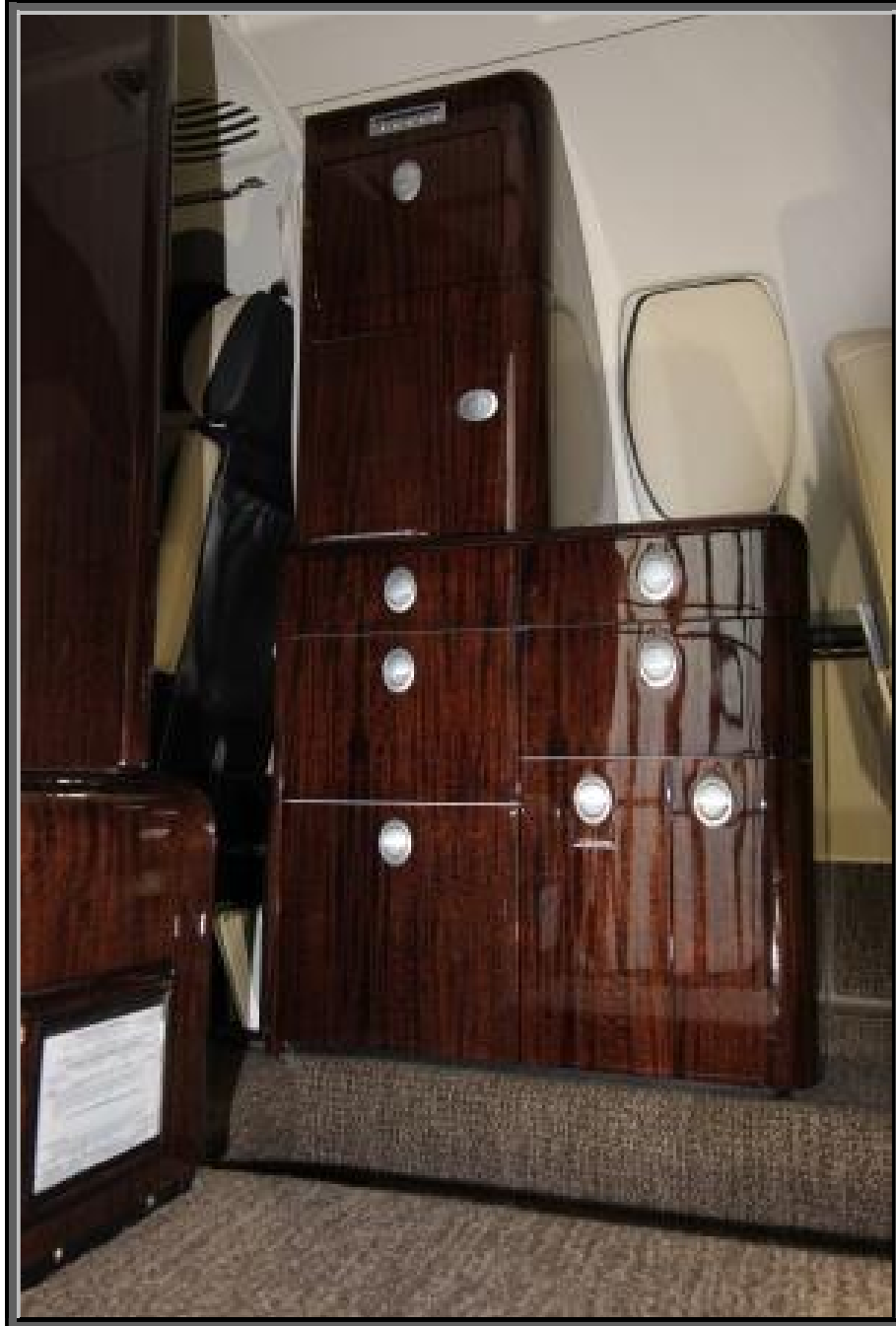
New Factory Deluxe Galley