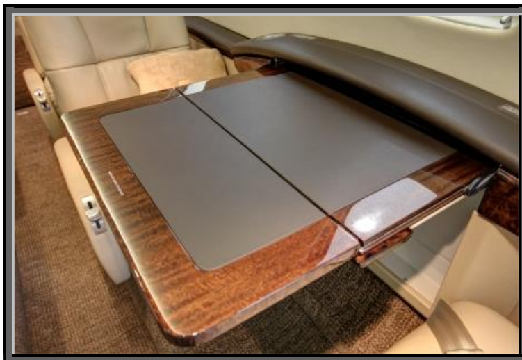
Gloss Laminate/Leather Inlayed Work Tables